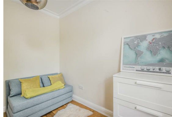
Bedroom 1 11'3" x 10'2" (3.45 x 3.10)